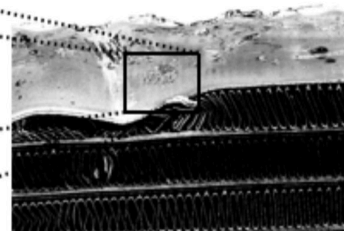
Heater core passage was cut open to show 3 pinhole leaks caused by electrolysis